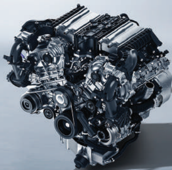
2.0 Liter Turbo -HEV (Petrol)