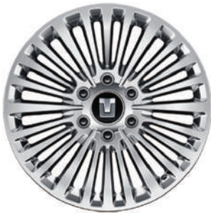
20 Inch Alloy