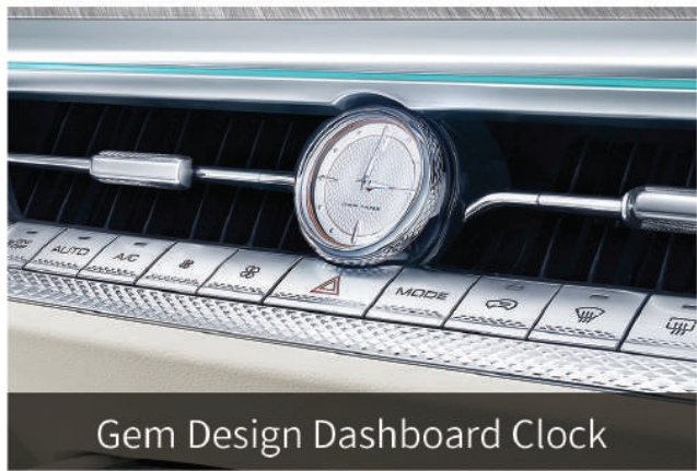
Gem Design Dashboard Clock