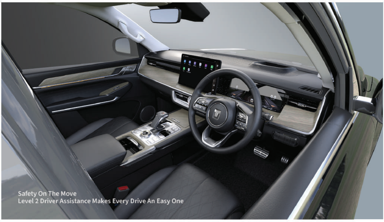
Safety On The Move Level 2 Driver Assistance Makes Every Drive An Easy One