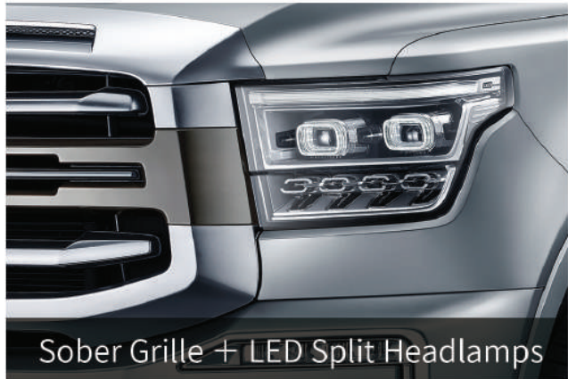
Sober Grille + LED Split Headlamps