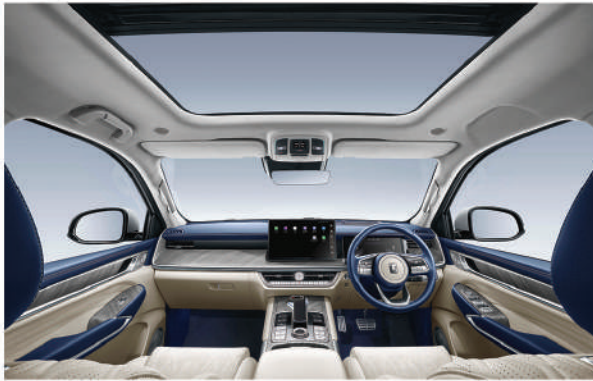
Blue & Beige