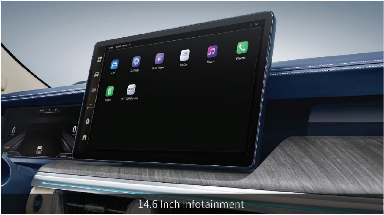
14.6 Inch Infotainment