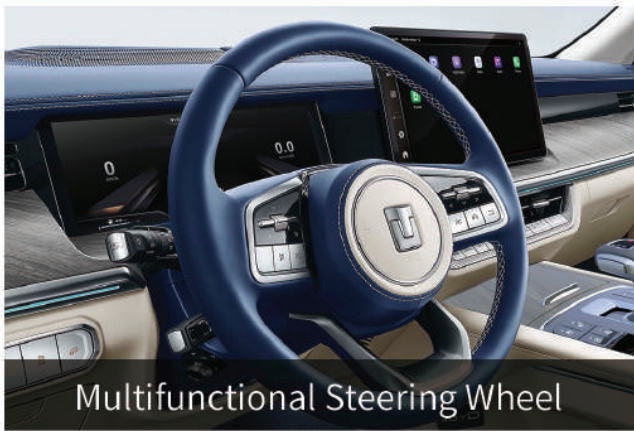
Multifunctional Steering Wheel