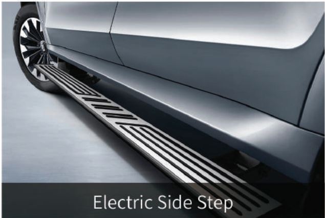
Electric Side Step