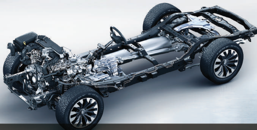
Professional Off-road Suspension & Body-on-Frame Chassis

Latest Gen All Terrain System to Conquer Any Challenge